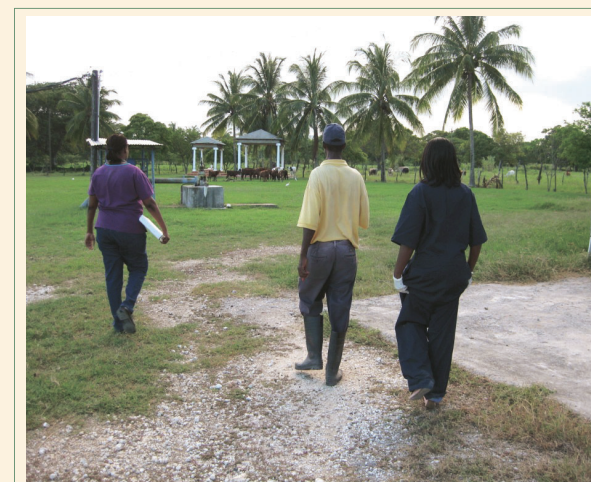
Animal health personnel observing a herd of cattle at Bodles Field Station.