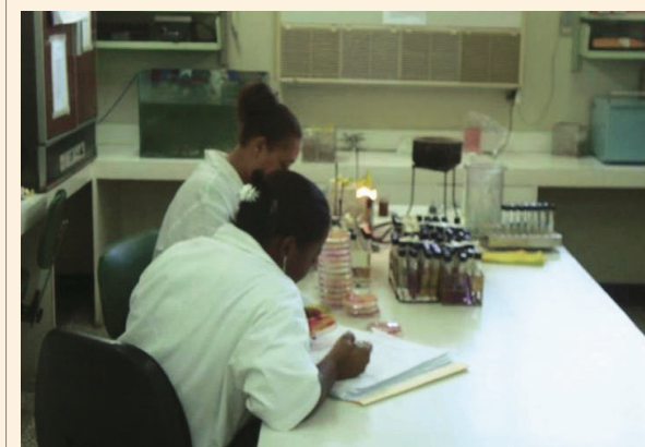
Salmonella testing at the Veterinary Services Division Diagnostic Laboratory.