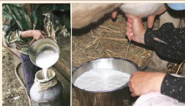
Raw milk is poured into a churn to be delivered to the processing plant for pasteurization.